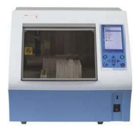
Instrument for AutoMag Solution (Cat.# 21101)